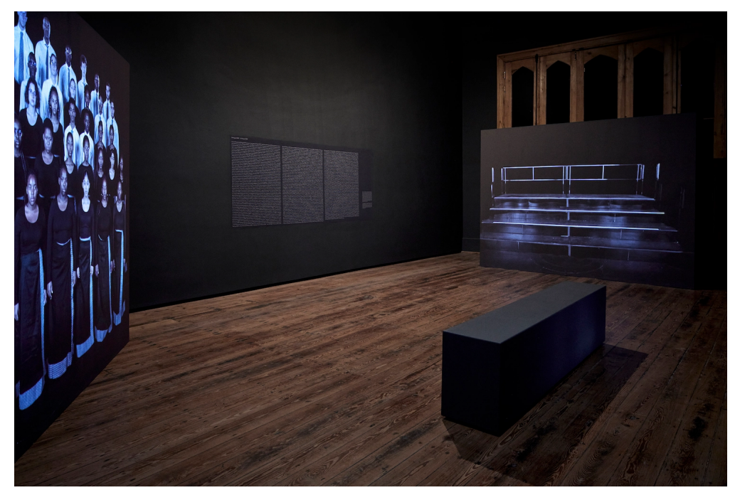
Gabrielle Goliath, Chorus , 2021, 2-channel video and sound installation, Goodman Gallery Cape Town HAYDEN PHIPPS

The project is far from Goliath's first to engage with victims of gender-based violence or to create opportunities for reflection and dialogue. In 2015, Goliath began the long-term performance project_(https://www.gabriellegoliath.com/elegy), Elegy, which similarly responds to the endemic crisis of femicide in South Africa. For the project, performances were held in South Africa, Brazil, Europe, and the United States, where seven female opera singers sounded a lament over the course of an hour – collectively sustaining a single note, passing it to one another as they individually mounted an illuminated dais. Each performance commemorated a specific woman or LGBTQIA+ individual subjected to fatal acts of gender or sexual violence. Accompanying each performance was a eulogistic text, scripted by a friend or family member of the subject.