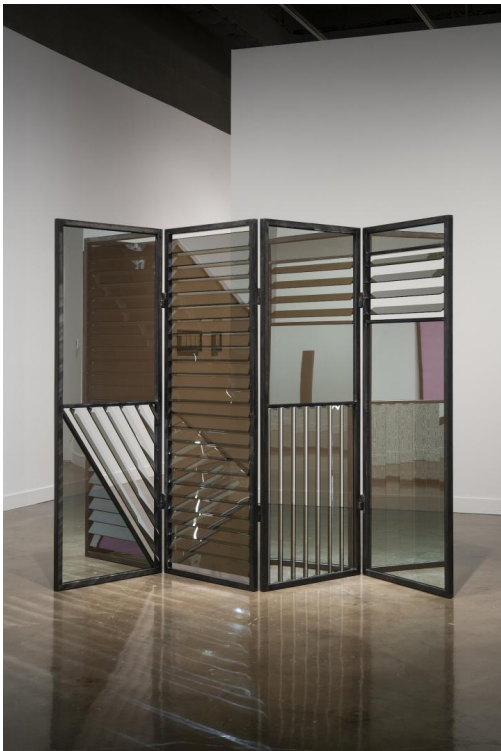
Kapwani Kiwanga, “Jalousie”

Another sculpture, “Jalousie,” looks a bit like a Sol LeWitt wall drawing, except it’s made from two-way mirrors and steel. (“Jalousie” is the term for a patented type of louvered window that allows for airflow without being completely see-through.) Resembling both a hand-held lantern and a privacy screen, this object continues the surveillance state metaphor: the viewer can stand on either side of the two-way mirror’s intelligence-gathering divide.