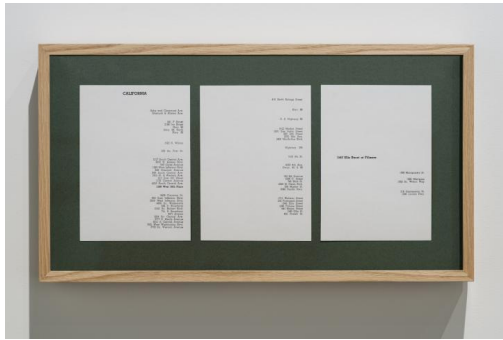
Kapwani Kiwanga, "Greenbook (1961)"

Kiwanga offers a refreshing multifaceted perspective that, in concert with her sculptures, doesn't allow us to define our history as an accidental or unique local condition.