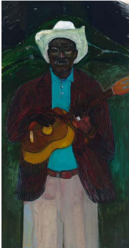
Peter Doig, I do not sing because I am happy. I sing the song because it is about happiness. Embah, 2017