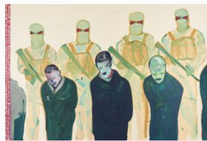
Carla Busuttill Choice Click Bait , 2015. Oil on canvas

A female child is foregrounded, posed like one of the women in Picasso's Desmoiselles D'Avignon . This young girl makes eye contact with the viewer. This returning gaze, a deeply disconcerting, direct engagement between subject and viewer, inverts the power dynamic between the observed and the observer. The title conjures colonial issues that South Africans still struggle to negotiate. Who belongs, who does not, and who decides this? In a society proselytizing a western mode of thought it becomes apparent that ideals of freedom belong to an ever-shrinking group of people.