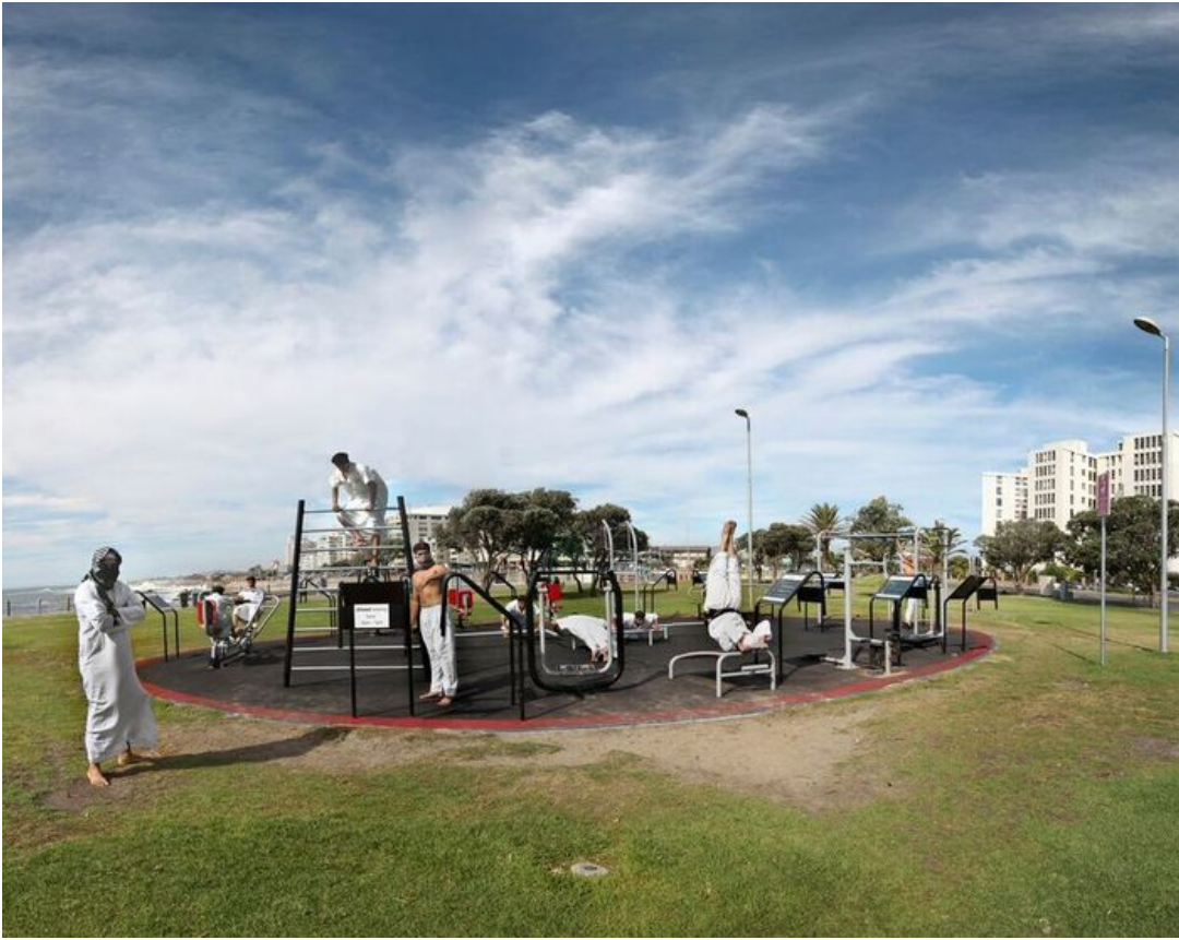
Hasan and Husain Essop, Freedom Fighters , 2014, Diasec-mounted lightjet C- print on archival paper, 115 x 145 cm