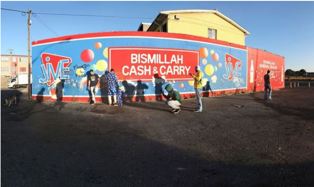
Hasan and Husain Essop, 786 , 2014, Diasec-mounted lightjet C- print on archival paper, 115 x 193 cm