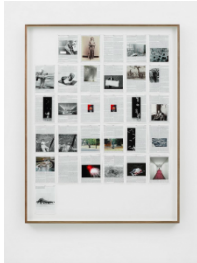
Adam Broomberg & Oliver Chanarin, Genesis , 2013. King James Bible, Hahnemühle print, brass pins, Framed: 145 x 112 x 5 cm. Edition of 3

The exhibition and book also draw substantially on contemporary philosopher Adi Ophir's reading of the biblical text as the Machiavellian machinations of an angry despot. The thread of power exerted through violence, and violence as an expression of power is eerily present in both ancient and contemporary times. One such work, titled Haggai , comprises a single sheet of the King James Bible on which the words "shake the heavens and earth" are neatly underscored in red. Another, Genesis , is a grid of thirty pages, among the images pasted onto them is a limp body being prodded, a sepia photograph of a native American, and a man hanged from a tree – images that capture different manifestations of violence.